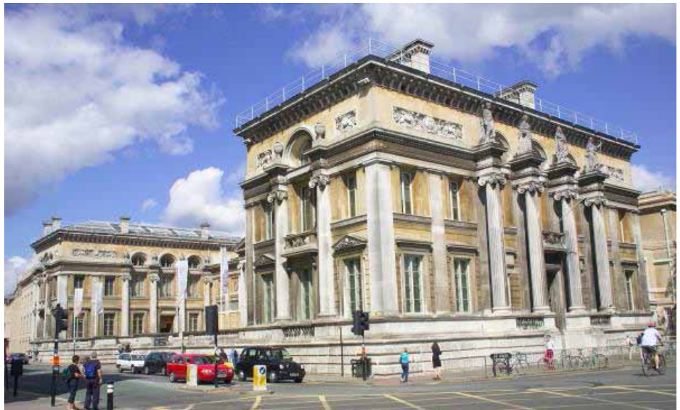
Ashmolean Museum in Oxford