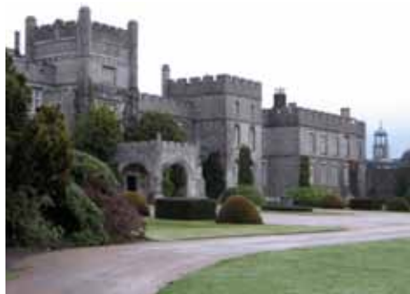
West Dean College, Chichester