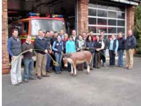
2009 BEVA/Lyndhurst Rescue and Emergency Medicine Training for Equine Veterinarians