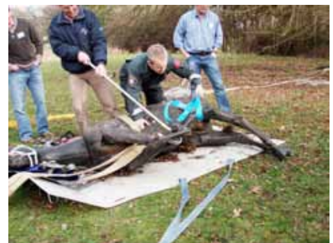
Use of crook and rescue glide for package and transport of injured horse