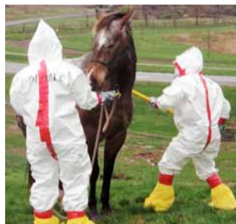
Comparison of clothing styles and effect on horses Comparison of clothing styles and effect on horses