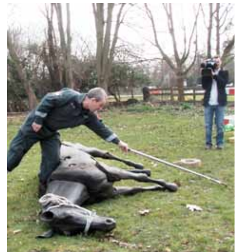
Use of crook and reach technique