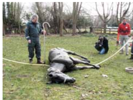
Use of strop guide to thread strop under horse mannequin