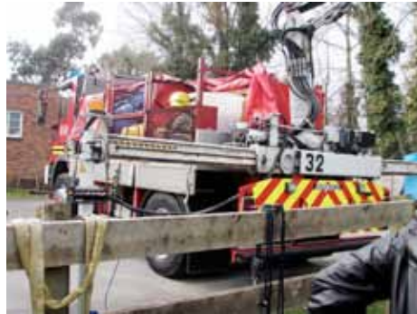
Multi-role vehicle (MRV) showing crane and rescue cranes