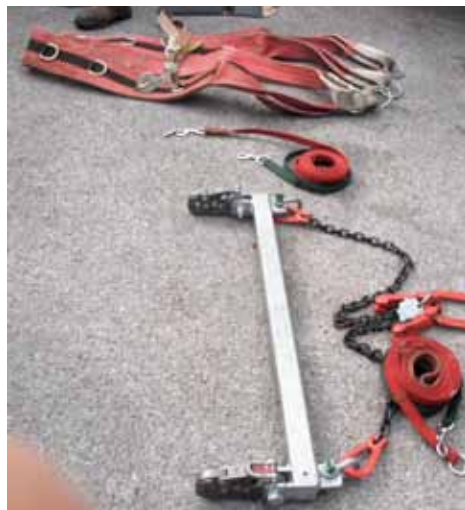
The quick release winch adapted from yachting use