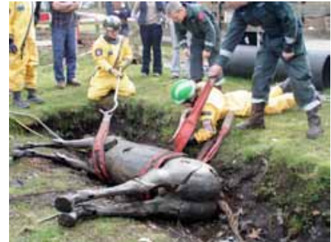
Demonstration of trench rescue techniques