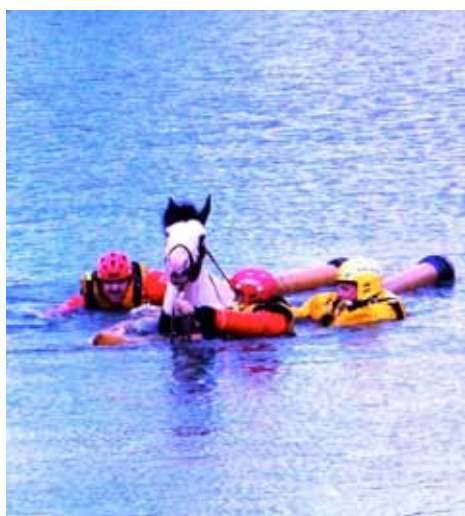
Flood rescue demonstration using flotation rescue device