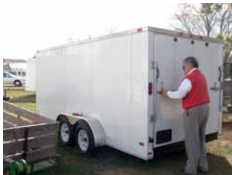
Chester Lowder with the CAMET