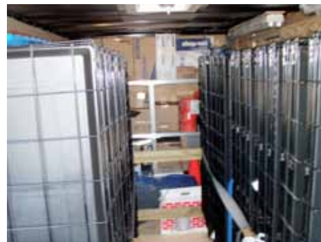
Interior of CAMET unit