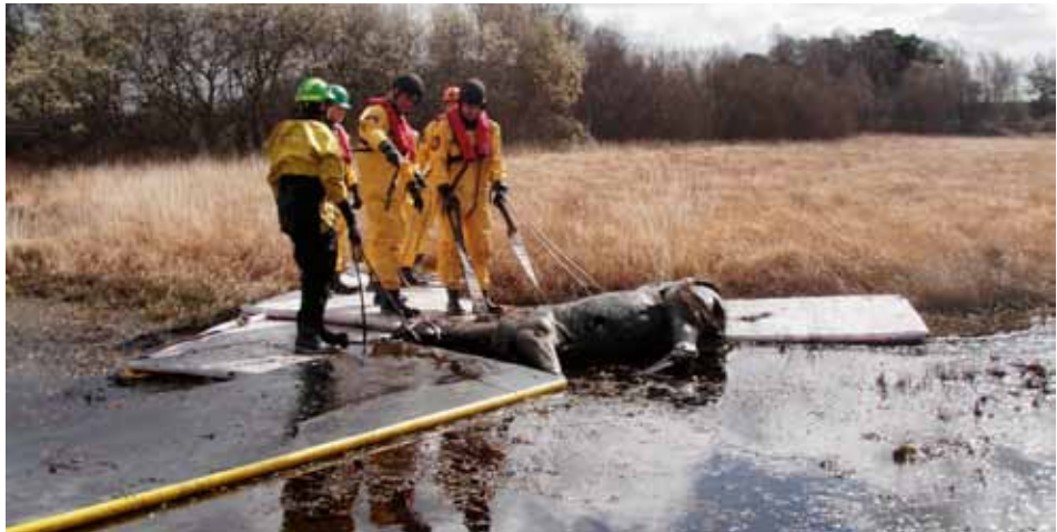
Demonstration of mire rescue, using inflatable rescue paths