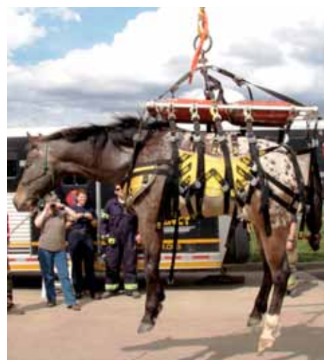
Helicopter lift demonstration using Anderson Sling device