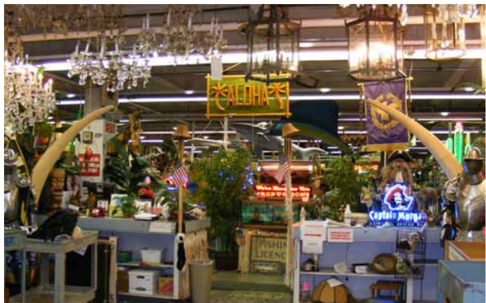
Universal Studios Prop Store reception area