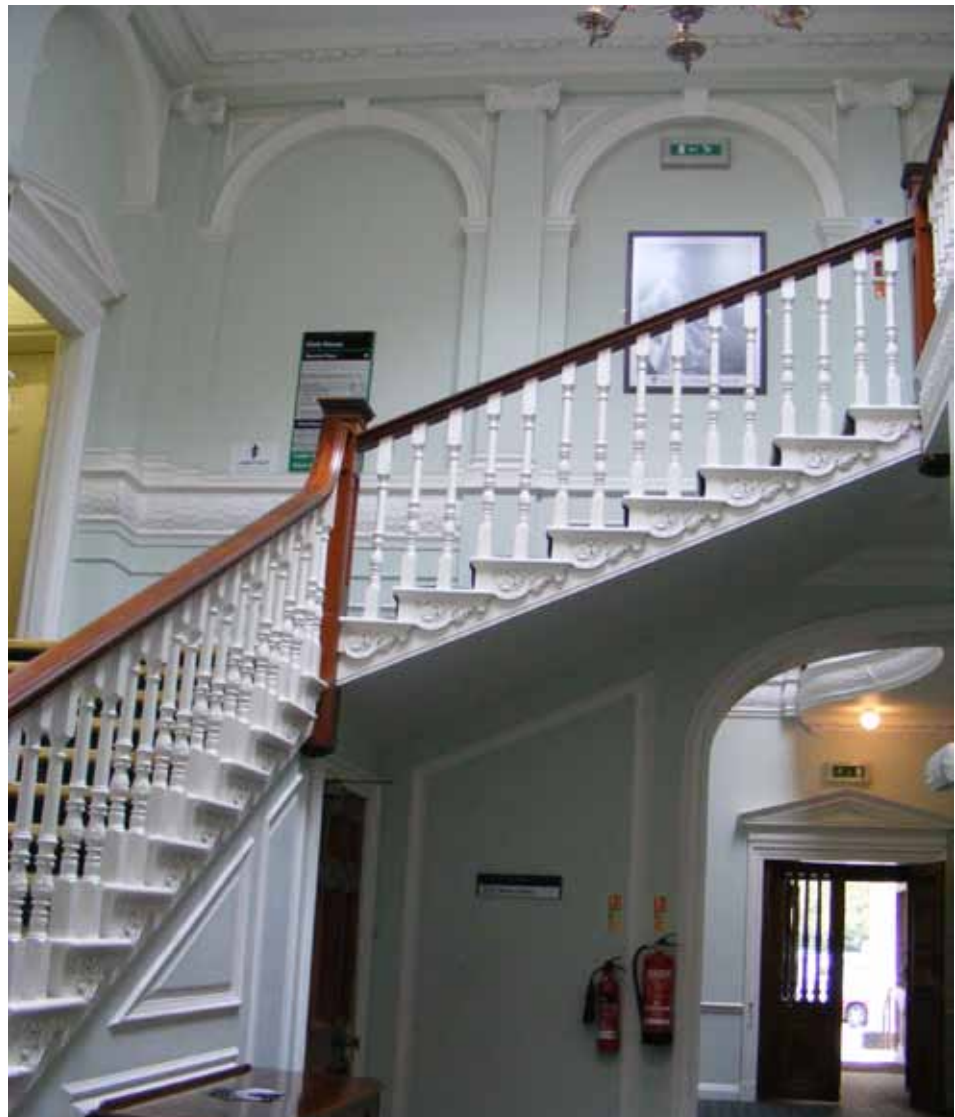
Interiors of buildings at Pinewood Studios offer fine examples of architectural details for student reference

The facilities of FDI are limited compared to other training facilities observed during the Fellowship study tour. They consist of two adjoining rooms creating a design office and drafting room. The location of the school, though, makes up for its limited size. It is located in the Pinewood Studio facility where students can see major film and television programmes in the making, and have access to world famous workshops on site and the famous Pinewood Archive library. The buildings themselves at Pinewood are fine examples of British architectural heritage; hence a rich source of architectural detail is immediately available.