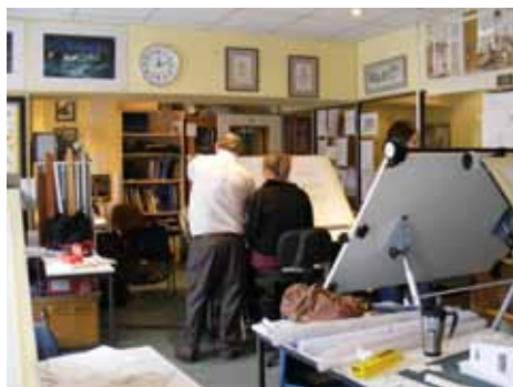
Student working on design drafting project at Film Design International, Pinewood Studios. The rudiments of film design drawing are considered an important foundation for career advancement at FDI.