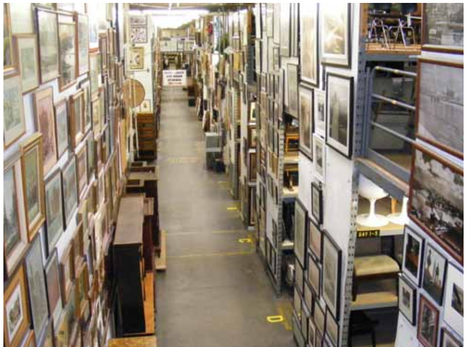
A small proportion of the many artwork props available at Sony Pictures Studios Property Department