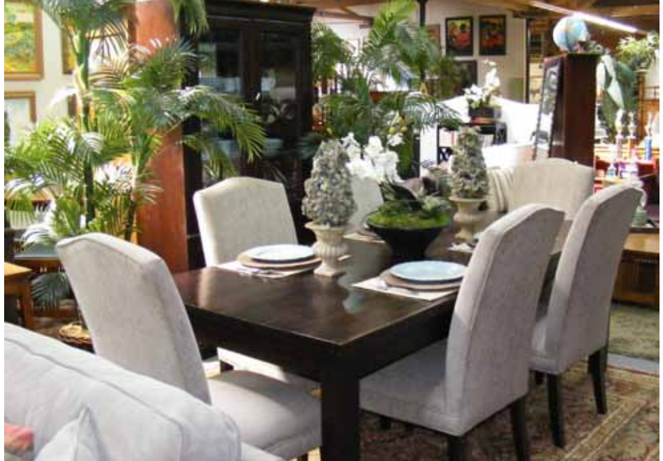
Dining room dressing props displayed as a 'vignette'

The Hollywood and Los Angeles locations interface via a video link allowing clients to view inventories at each locale on a big screen monitor, so when customers come into either prop store and cannot find what they need, they can access the database from both stores with ease and in comfort. Orders are placed and/or picked up at either locale, with location delivery arrangements available upon request. A conference area and Wi-Fi Internet connectivity is also available at both locations.