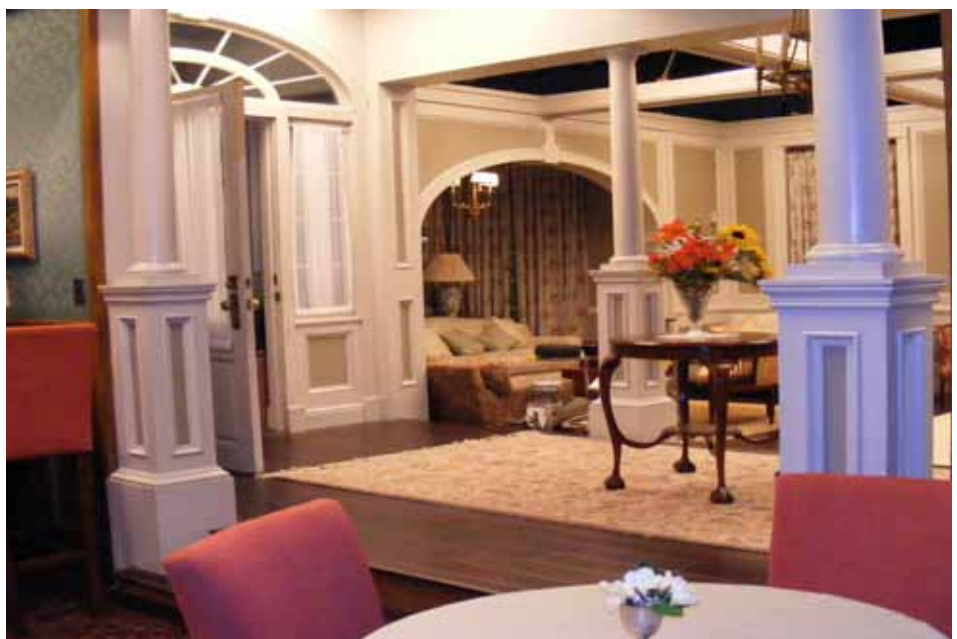
Permanent set for student production of 'Faulty Towers'. The set, though permanent, is dressed and 'worked' by students under the careful supervision of practising professionals