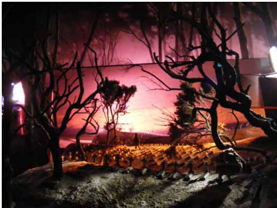
Miniature animation set ready for filming

NTFS offers work experience placements on current productions at local film studios, such as Pinewood and Shepparton, where students work in the art department alongside production designers and art directors (See Attachment 4 in the Attachments section). These placements are monitored by feedback from the art department. Postgraduate employment is monitored through a database in the NTFS library and often postgraduates will return to NTFS to teach and pass on their new knowledge.