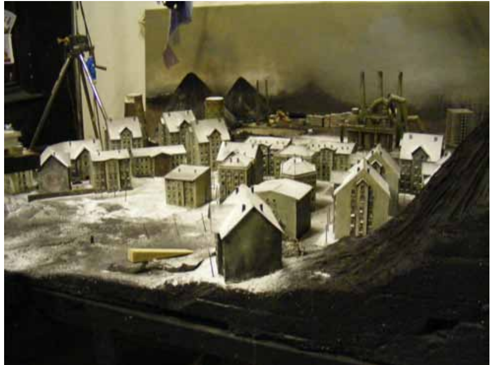
Miniature film set for a student animation production