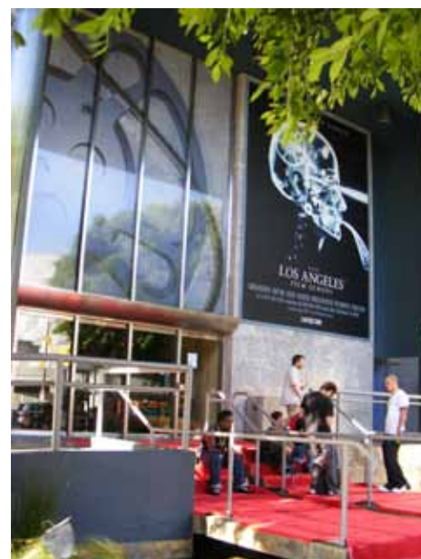
Main entrance to Los Angeles Film School

The facilities are extensive and impressive including a fully equipped studio set on a professional state-of-the-art sound stage. There are also prop and scenery storage facilities, a full size cinema, a large rehearsal space and many professional quality labs including a three-dimensional plotter. The Production Design Laboratory at the LAFS is equipped with ten drafting tables, an extensive library of art and design books, and a conference table.