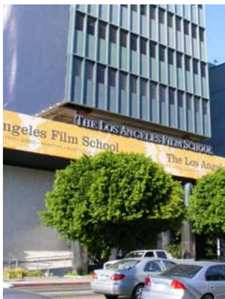
Los Angeles Film School, Hollywood