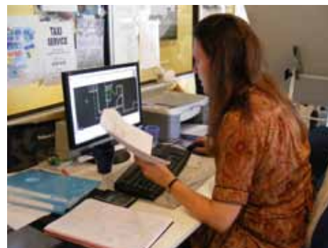
Computer aided drafting is also taught at FDI, after the student has gained the basic construction knowledge in manual drafting and drawing