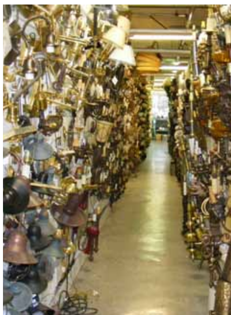
Lighting fixture props in all period styles

The props are used for NBC Universal productions, as well as rented to external organisations for film, television, commercials, music videos and events.