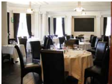
The 'Hitchcock Room' Georgian-style restaurant at Pinewood Studios. The light fittings are heritage protected as fine examples of interior decoration.