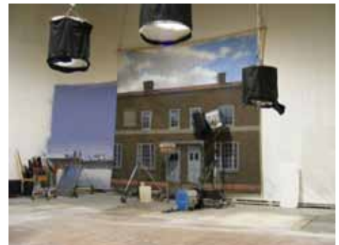
Scenic art craft workshop. Practising professionals hold workshops in the more traditional scenery finishing techniques.