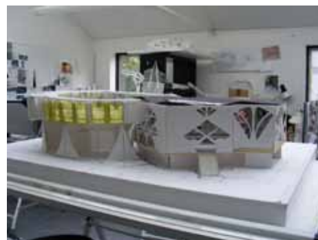
A cardboard model of student work in progress