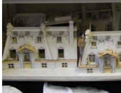
Examples of student cardboard models