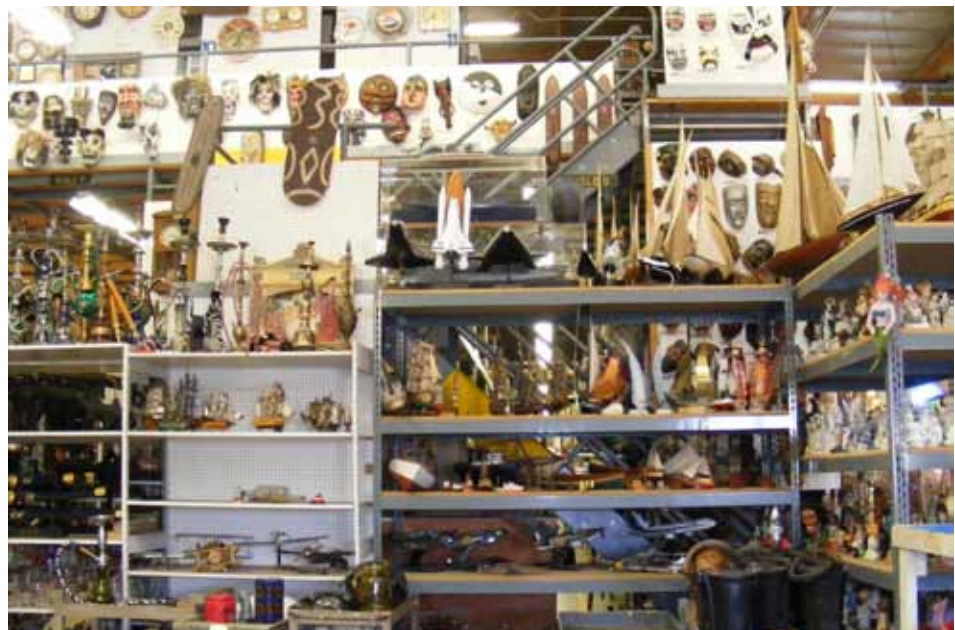
Typical dressing props found at Sony Pictures Studios Property Department, Los Angeles