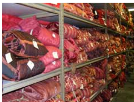
Some of the huge range of drapery props arranged in colour categories. Many pieces are from the original period