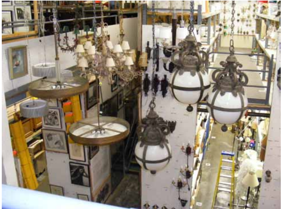
Lighting fixture props from all periods