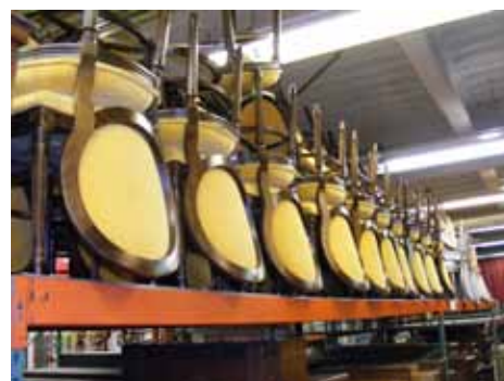
Period furniture props are available in large numbers and all period styles

The props are managed using a software solution in which all props are bar-coded and photographed, then tracked through a computer database. Props are stored using the traditional methods of shelving and racks to display items. The props are well organised and divided into appropriate sections.