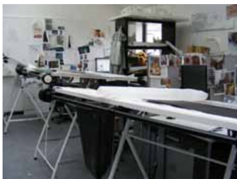
Student work stations in the Production Design Department at The National Film and Television School, UK. Students use both manual and CAD drawing methods in their projects

The facilities at NTFS are impressive including stages with workshops, prop rooms, seminar rooms, a cinema, design offices, construction workshop, animation stages and green screen.