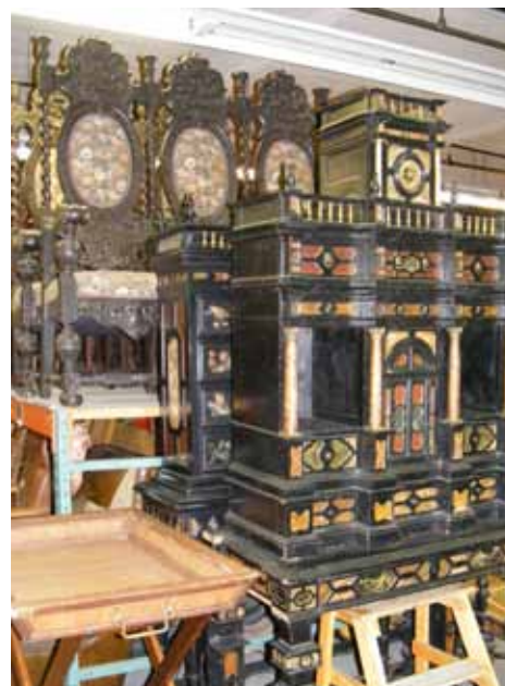
Period furniture props typical of the huge range available at the Universal Studios Prop Store