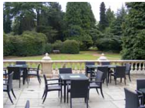
The grounds at Pinewood studios have been used for many productions over many years