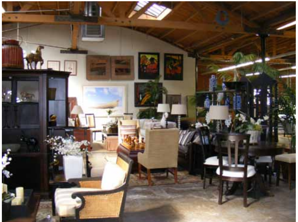
Furnishings and set decoration props in the new space at Prop Services West