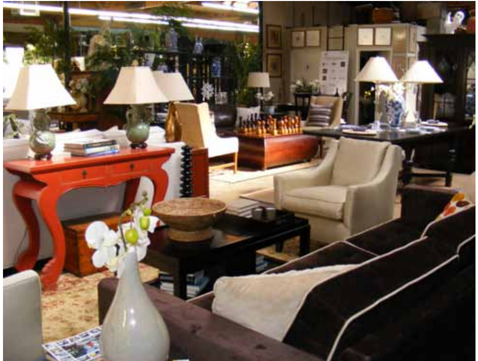
Displays of furnishings and dressing props at Prop Services West