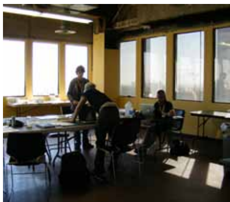
Students working on projects in the Production Design Department.

The curriculum addresses the constantly evolving world of entertainment by combining technical knowledge with artistic exploration and creativity. By focusing on both the art and science of creating entertainment, the school provides students with a comprehensive education that allows them to discover their individual talents through collaboration and experience. As a result, the LAFS readies students for success throughout their professional lives while helping them realise their career goals in the entertainment and media industry.