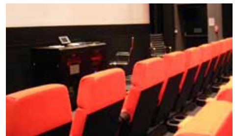
Lecture and screening theatre at NTFS, UK