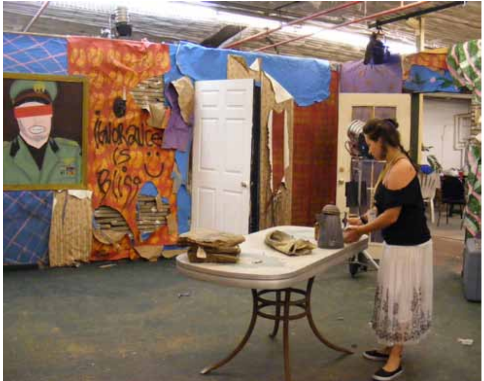
Set finishing workshop. Here students can experiment with techniques and methods in producing set finishes