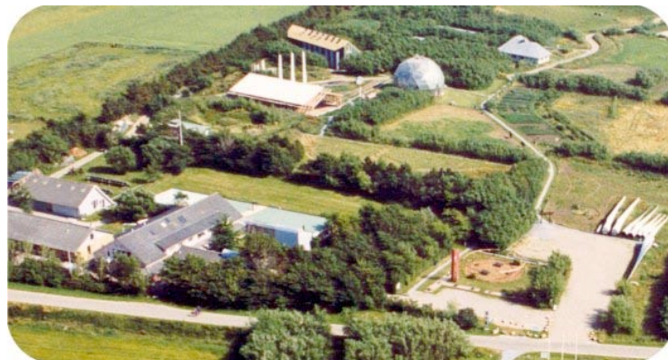
Folkecentre for Renewable Energy - Denmark

Germany in contrast continues to be the leader in all areas associated with the adoption of renewable energy as a form of electricity generation. With the purpose of protecting the environment, managing global warming and securing a reliable energy supply, the German Government and the German Bundestag committed themselves to at least doubling the percentage share of renewable energy in total energy supply by the year 2010 (Maegaard 2002)