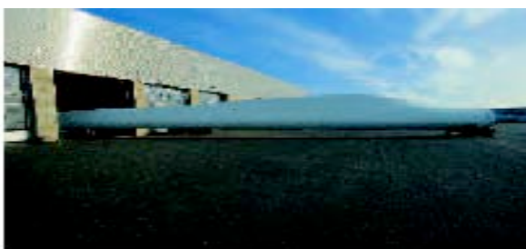
A LM Glasfiber blade coming from the factory

Following this introduction I was given the opportunity to take a tour of the facilities at the Lunderskov facilities which covered two sites which included manufacturing, design and administration functions. It was interesting to compare the manufacturing centres and processes to the NEG Micon facilities in the UK. The house keeping requirements in terms of everything in the plant having a place was paramount in the Denmark with no waste materials in view; each worker was also required to sign off on each work instruction related to the manufacturing process for the particular blade they were working on. In contrast the UK plant was far more cluttered with materials and this can be attributed in part to the blades made by NEG Micon consisting of timber and carbon components with the LM blades being made entirely of composite materials. Another reason for the differences is that LM has a much longer history in making blades compared to NEG Micon which is still refining their processes which includes the training of staff in the correct manufacturing processes including good house keeping skills.