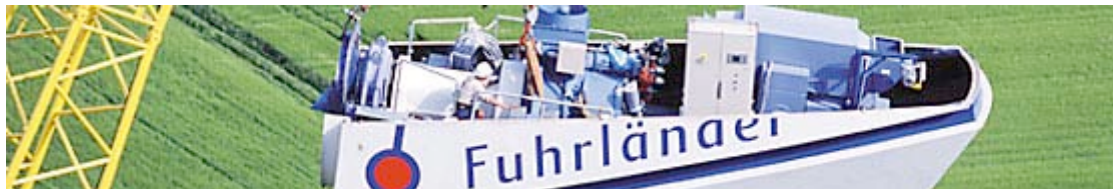
Installation of a generator on one of the Fuhrlander Wind Turbines www.fuhrlander.de

In a broader discussion with Dr Ross about the reasons why there had been such a significant increase in wind power in Germany over the previous five years he suggested that it could be attributed in large part to the German government. This support has seen a number of acts passed as law which ensures that electricity generated through renewable energy increase significantly by 2010. One law for example that has been adopted introduces minimum prices for feeding into the electricity grid one way in which to make the industry viable.