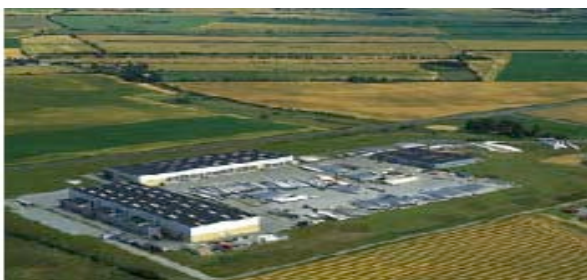
The Lunderskov site in Denmark www.lm.dk