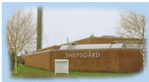
Front entrance to the AMUSYD centre.

The visit provided the first real opportunity to see a training program that catered for the rotor blade manufacturing industry and the openness and information offered by Jen's was excellent. It gave me a some clear direction as to what is the standard of training offered by a training provider who is delivering a program that industry both recognises as the level required for entry level trainees which will be the trainees we will be delivering to at our Portland campus. The visit also provided me with some confidence that program format that I had been starting to formulate in conjunction with the training staff from NEG-Micon was moving in the right direction and that we now had a clear bench mark in which to strive towards in relation to program delivery.