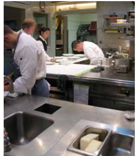
French Laundry kitchens