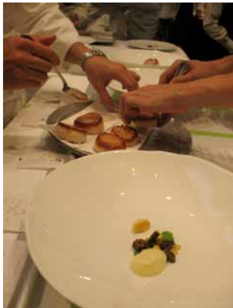
French Laundry dish

The excellent relationships between The French Laundry and its local suppliers ensure fresh produce is always available in a timely manner. For example, the Jacobsen farm located close to the restaurant has been supplying soft berry varieties and other fruits for many years. These supplier relationships also bring with it the added value of growers being able and willing to respond to The French Laundry's requirements for specific—sometimes exotic—produce.