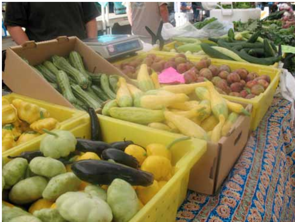
St Helena Farmers Market