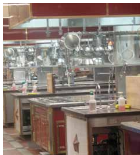
The CIA kitchen