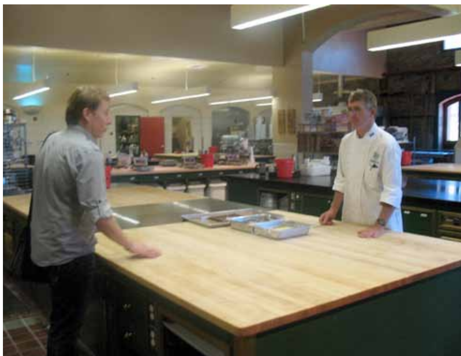
The CIA kitchen

Like what is being done by the CIA in the Napa Valley, regional culinary and hospitality training organisations throughout Australia need to become more active in promoting and nurturing regional produce. Furthermore, Australian Registered Training Organisations (RTOs) and the hospitality industry need to collaborate in produce and delivering regional food competency units for inclusion in the current Hospitality Training Package.