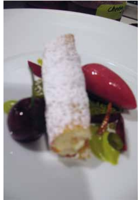
French Laundry dish

As part of its supply chain, the restaurant and other TKRG food outlets also have access to a TKRG-owned garden located directly across the road from The French Laundry. Under the management of Tucker Taylor, the garden's organic produce supplies around a quarter of the vegetable, herb and edible flower requirements of TKRG businesses. The TKRG garden boasts hot houses and a state-of-the-art irrigation system. It also welcomes visitors who are able stroll around on grassed pathways.