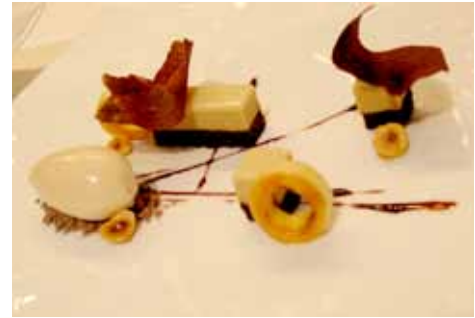
French Laundry dish

Immediately on arrival in Yountville, the Fellow commenced work in the restaurant's pastry section. Under the direction of Wendy Sherwood, the Fellow immersed himself in preparing plated desserts, petit fours and chocolates. The French Laundry produces an extensive range of signature chocolates, some of which contain unique ingredients such as chillies and salted peanut caramels.