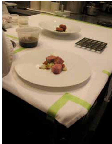
French Laundry dish