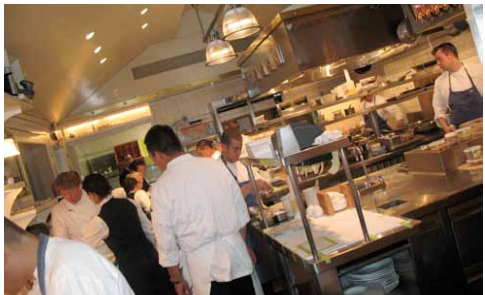
French Laundry kitchens