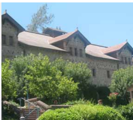
The CIA, Greystone campus