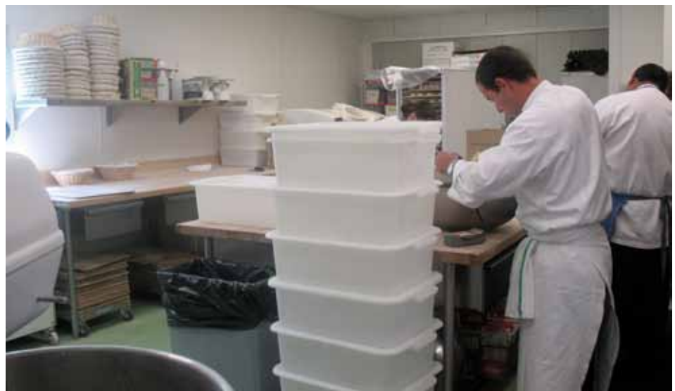
Production at Bouchon Bakery