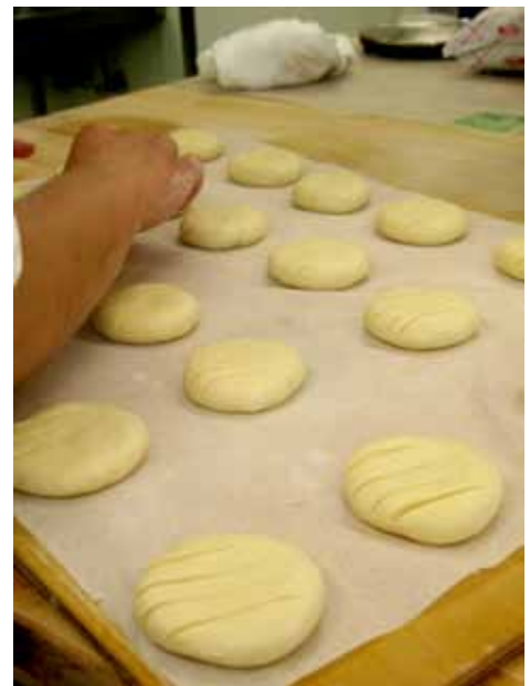
Production at Bouchon Bakery