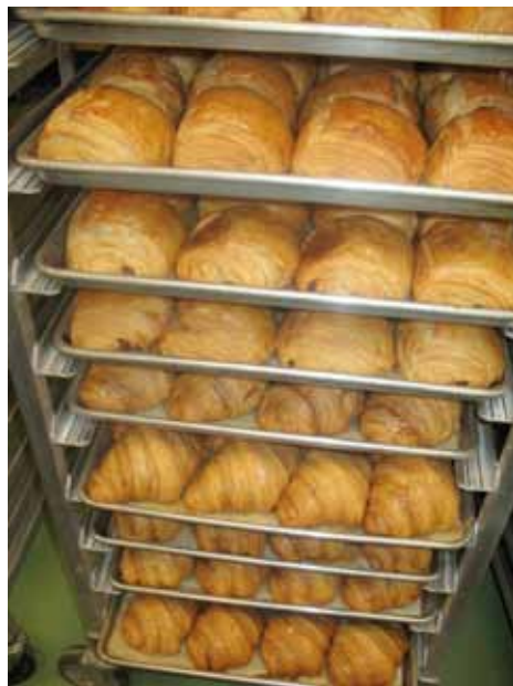
Production at Bouchon Bakery

Bouchon Bakery is another TKRG seven-day-a-week operation. This small, busy retail bakery outlet produces a range of artisan style breads, cakes and pastries.