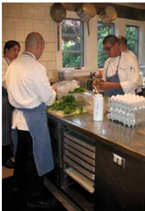
French Laundry kitchens

All produce arriving at the kitchen is checked by a Chef de Partie or Sous Chef prior to storage. No raw foodstuffs are left in the delivery containers. Fruit and vegetables are pre-washed, stored in deep covered plastic bins and labelled according to product name, date received and the individual who checked the consignment when it arrived.