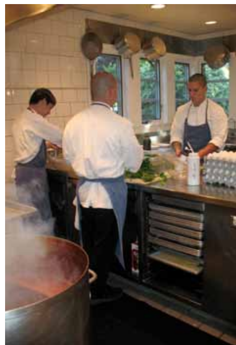
French Laundry kitchens

While the quality-assurance protocols used at The French Laundry provide a benchmark for all kitchens regardless of size and staff numbers, the Fellow has, unfortunately, witnessed too many instances in Australian commercial kitchens where produce has not been handled and processed correctly.