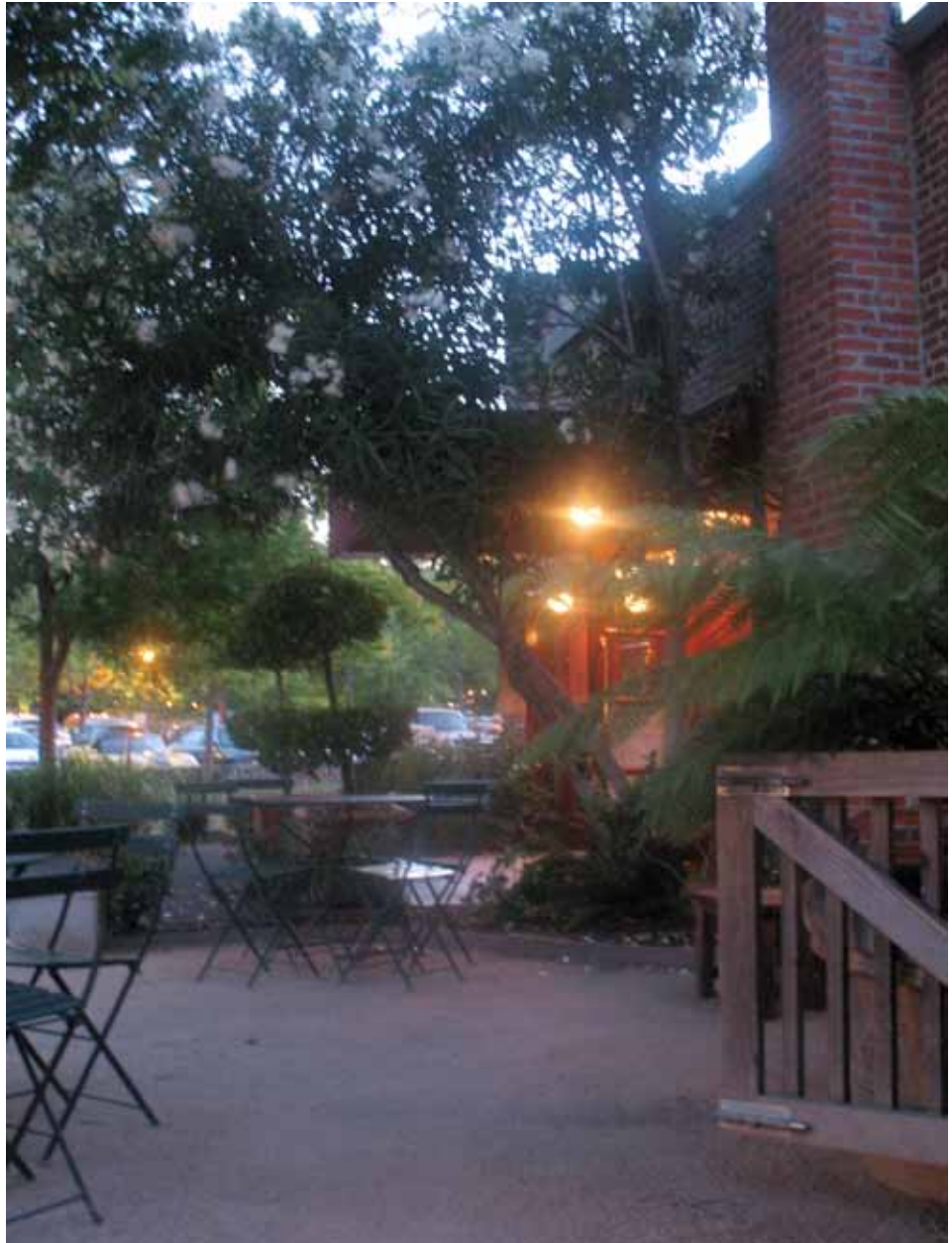
Outside Bouchon Bistro

The kitchen set up, workload and the style of food has similarities to mainstream Australian dining experiences.