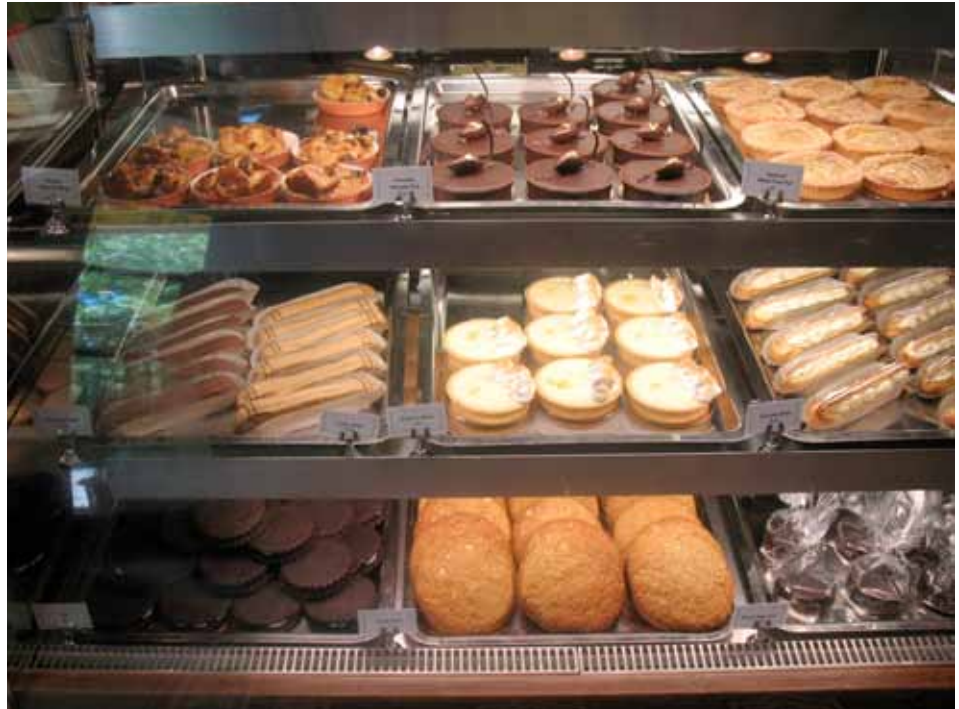
Products at Bouchon Bakery retail store