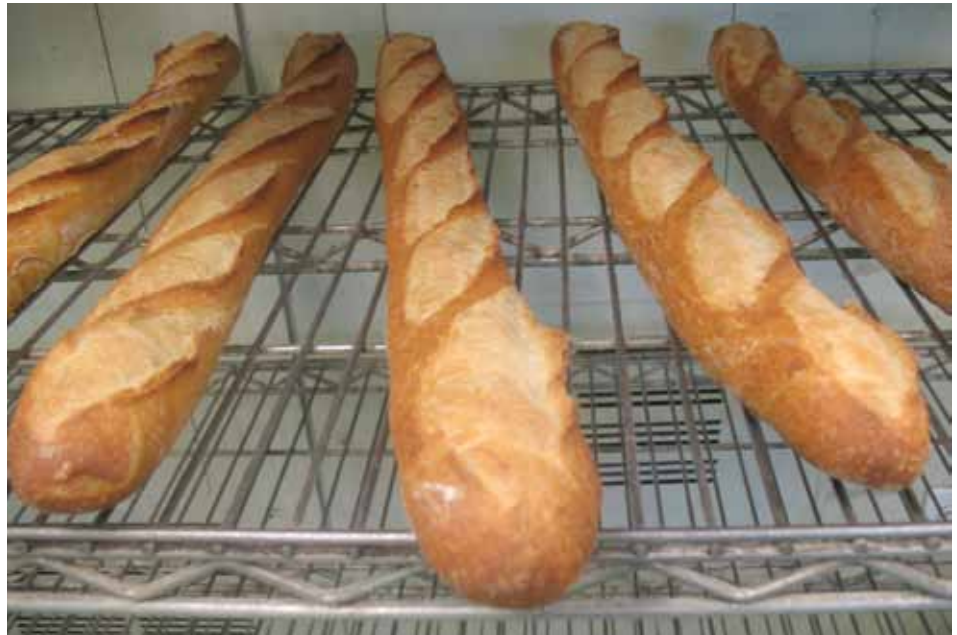
Products at Bouchon Bakery

Although the bakery does not offer dining facilities, it does provide outdoor tables for customers to use. In addition to producing all dessert items for the Bouchon Bistro and specialty breads for The French Laundry, the bakery also produces a range of breads for other cafes and restaurants in Yountville.