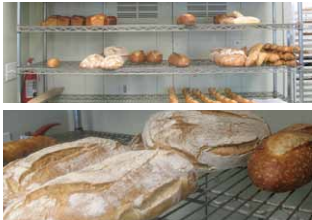
Different breads at Bouchon Bakery