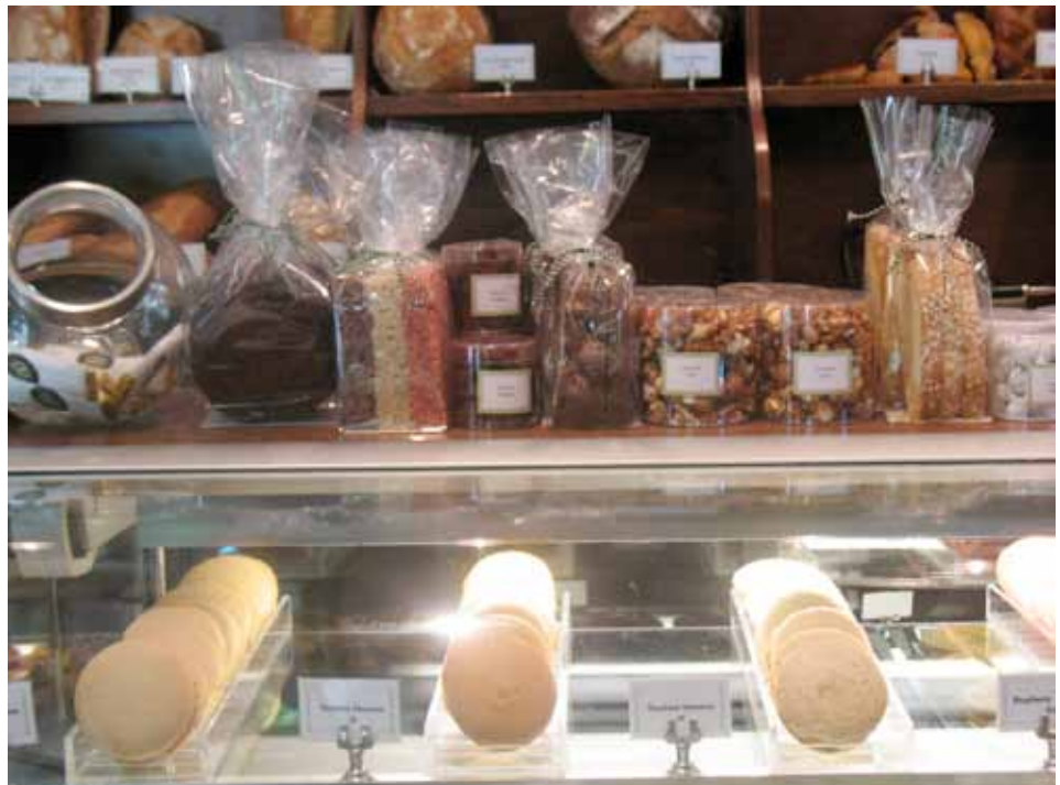
Products at Bouchon Bakery retail store