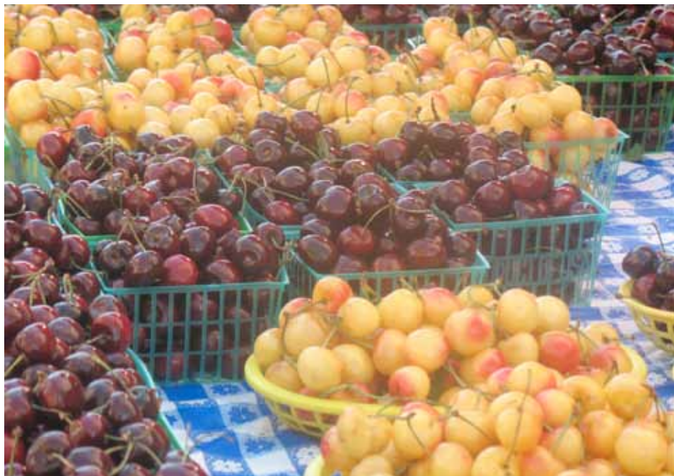
St Helena Farmers Market

St Helena is a 30-minute drive north of Yountville. For the past 24 years the St Helena Farmers Market has been running every Friday morning between May and October. The market has a wide variety of stalls ranging from fruit and vegetables to artisan cheese. The market is a magnet for Napa Valley chefs keen to access farm gate produce at competitive prices. It is also a popular meeting place on Friday mornings for local growers and producers as well as local and visiting food buffs. Students from the St Helena campus of the CIA have a stall at the market where they sell herbs, flowers and food they have prepared.