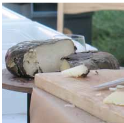
St Helena Farmers Market

Farmers markets such as St Helena offer low price fresh produce that may not be readily available in local supermarkets and retail stores. They are also a valuable community activity. Farmers markets are an excellent showcase for local and regional food industries.