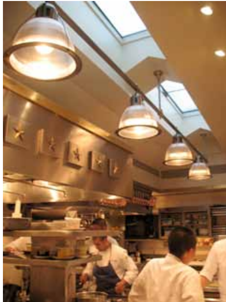
French laundry Pastry kitchen