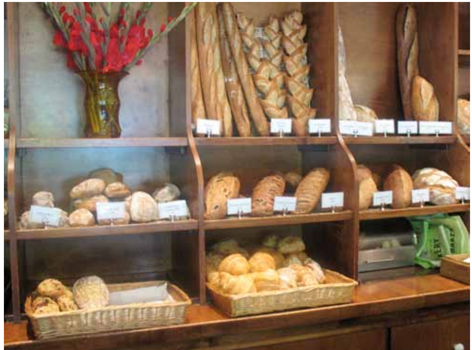
Products at Bouchon Bakery retail store