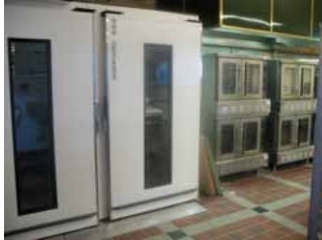
Equipment at the CIA