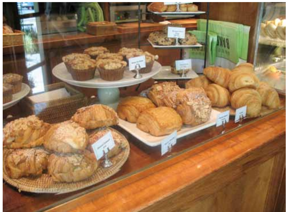
Products at Bouchon Bakery retail store