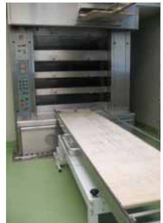
Bakers oven at Bouchon Bakery