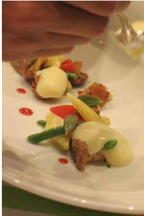
French Laundry dish