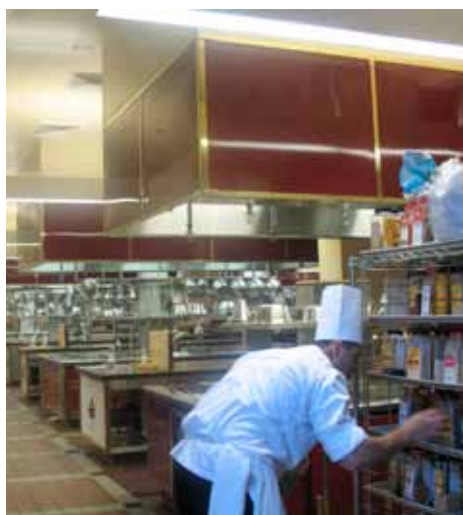
The CIA kitchen

Like what is being done by the CIA in the Napa Valley, regional culinary and hospitality training organisations throughout Australia need to become more active in promoting and nurturing regional produce. Furthermore, Australian Registered Training Organisations (RTOs) and the hospitality industry need to collaborate in produce and delivering regional food competency units for inclusion in the current Hospitality Training Package.