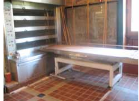
Equipment at the CIA