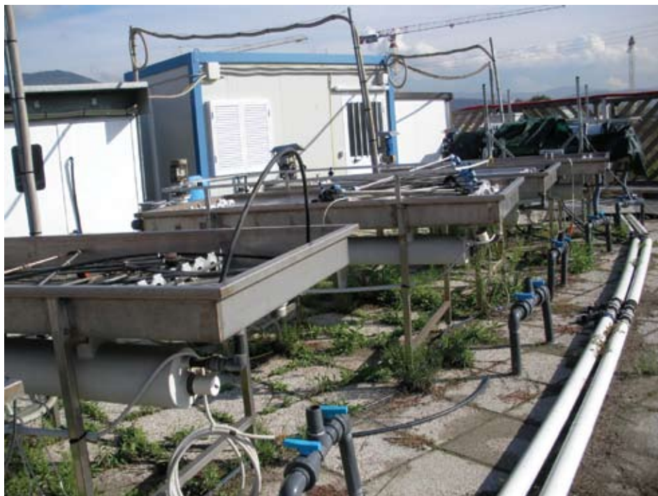
DNR Research Facility, Pisa. The cover tray at the rear is the first environmental trial ex laboratory for microalgae generated biohydrogen. It is hooded to collect hydrogen gas produced.

Professor Tredici considers that at scale production should be achievable over the next five years. The requirement now is for research to scale production facilities to be established to allow the accumulation of practical implementation skills and knowledge.