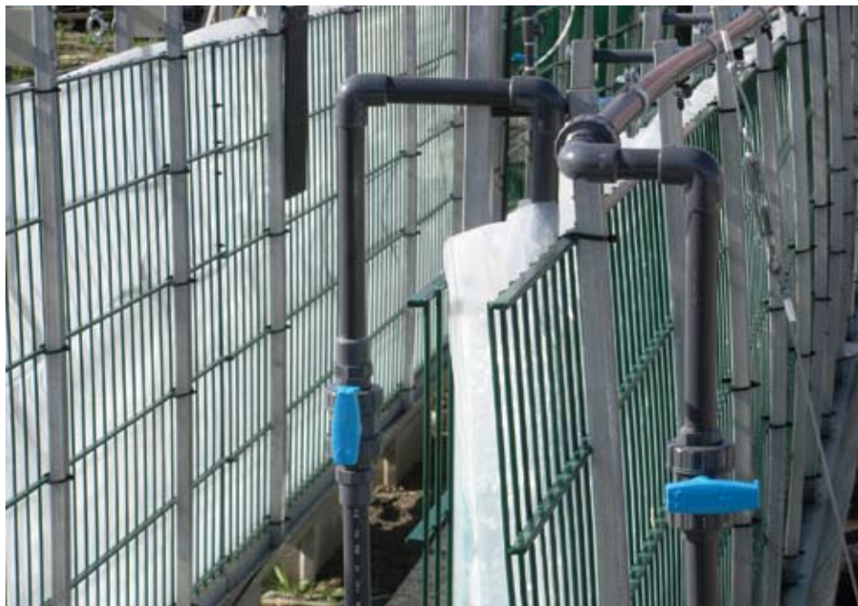
Microalgae photo bioreactor, Pisa