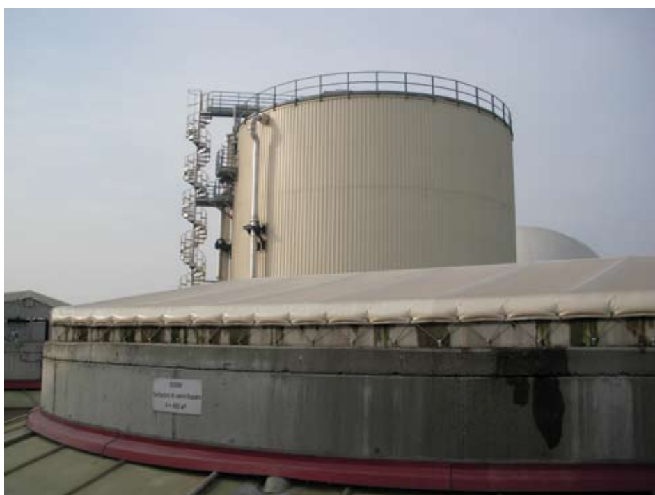
Annerobic digester, Venezia

The last day of the Symposium was a site tour of an anaerobic digestion facility, located about 40 minutes from Venice. This plant produces methane gas from municipal waste and animal manure sourced from the surrounding district. The gas is incinerated and sold into the electricity grid five days per week. Residual biomass is on sold for composting. There is no re-use of CO 2 emissions from the plant.