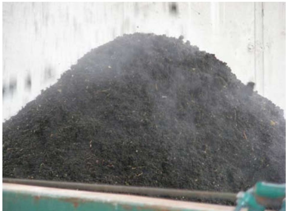
Processed MSW prior to shipping for composting

Microalgae, when under reasonable cultivation condition, may yield up to 27 tonnes oil, 30 tonnes carbohydrate and 40 tonnes of protein per hectare per year