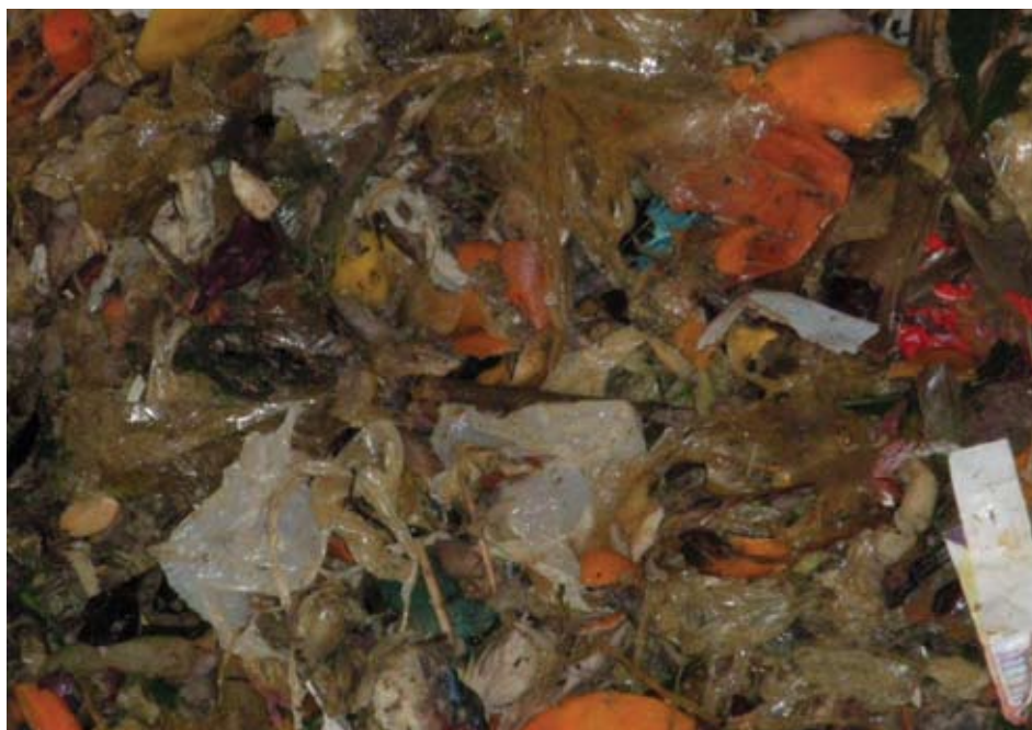
Household and commercial MSW prior to digestion. Note plastic residuals

Particular attention will be given in providing a copy of the Fellowship Report to Mildura Economic Development Corporation and to members of Parliament, as well as government agencies.