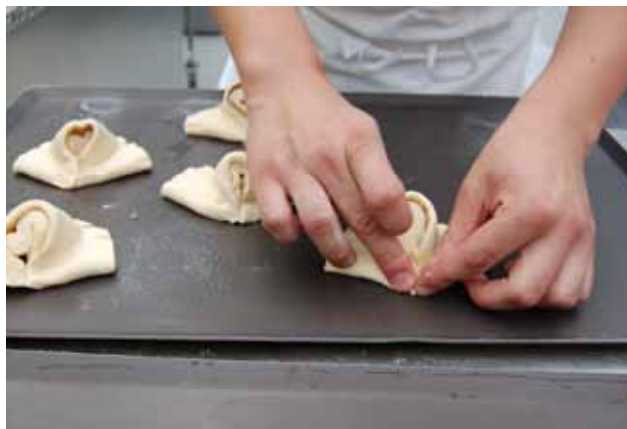
Processing Danish pastry, which contains improvers and dough conditioners