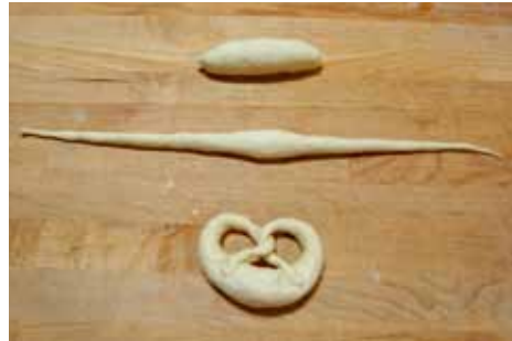
The preparation and formation of pretzels and lye bread products