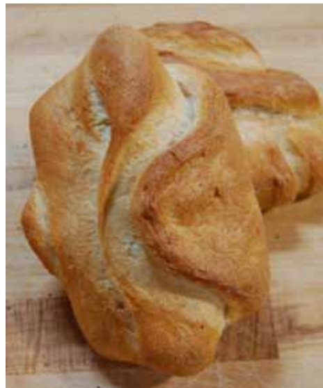
Some traditional German wheat-rye combination small bakery items