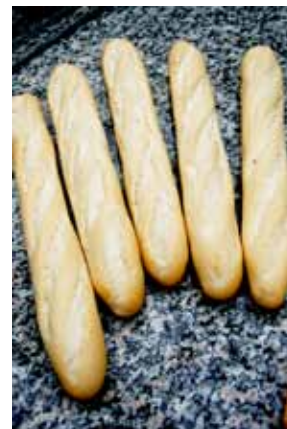
Par-bake products produced at PIC