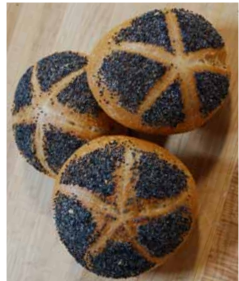
Some traditional German wheat-rye combination small bakery items

Traditional German bread baking uses different styles of levain as the starter culture. Unlike in France where the age of the levain is a source of pride, German starter cultures are replaced and refreshed every three months to maintain a high level of hygiene. The main method of production in Philippi's region of Germany utilises the Weinheimer Sourdough Scale. This scale of percentages and ratios in pre-fermented flour determines bread characteristics and aligns the bread production with national laws regarding labelling and ingredients. Megee learned how the timing and ratios of this scale could be manipulated with the use of three different rye-based levains: