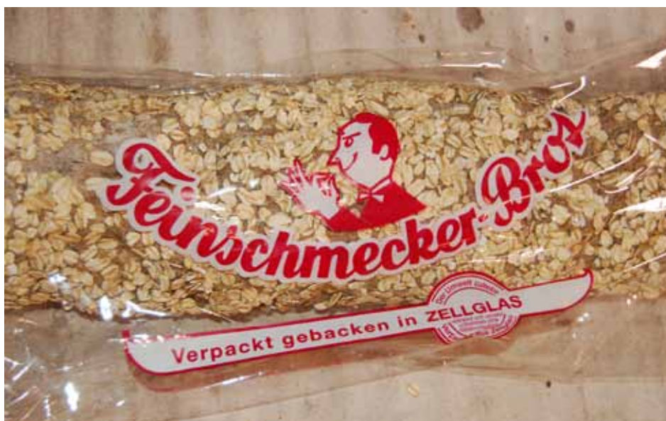
Rye bread baked in a thermally stable plastic bag