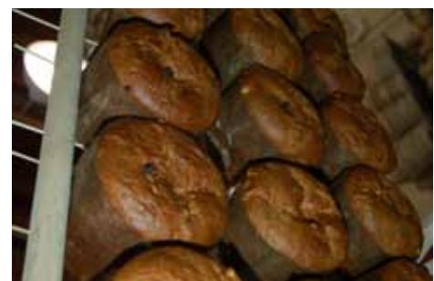
Panettone are inverted to maintain their final shape as they cool

Megee also studied the methods of retarding dough and their effects upon dough development. The three distinct methods are: