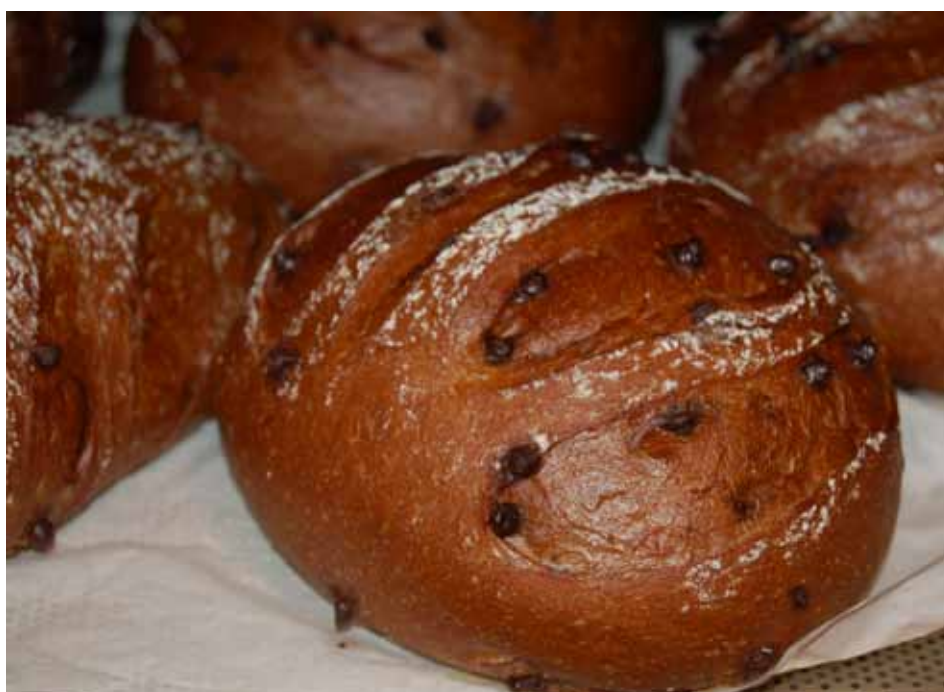
A sweet chocolate bread using a sour starter with 5 per cent rye flour

Comparatively few bakeries in Australia make a levain-based sweet bread and pastry such as a pan d'oro and panettone. This is partially due to the fact that the levain can create a high acidity level in the bread, deleteriously affecting the desired sweet effect. Megee learned, however, that building the levain over time and acclimatising it to the new environment before introduction to the final dough, negates the tendency toward a sour profile. Acidity levels are still present, fortifying the gluten structure normally weakened by the inclusion of fat and sugars within the typical profile of a sweet-enriched dough.