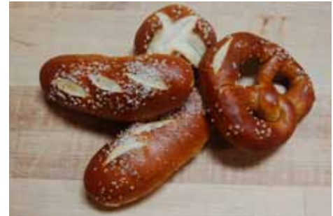
The final baked pretzels and lye bread products