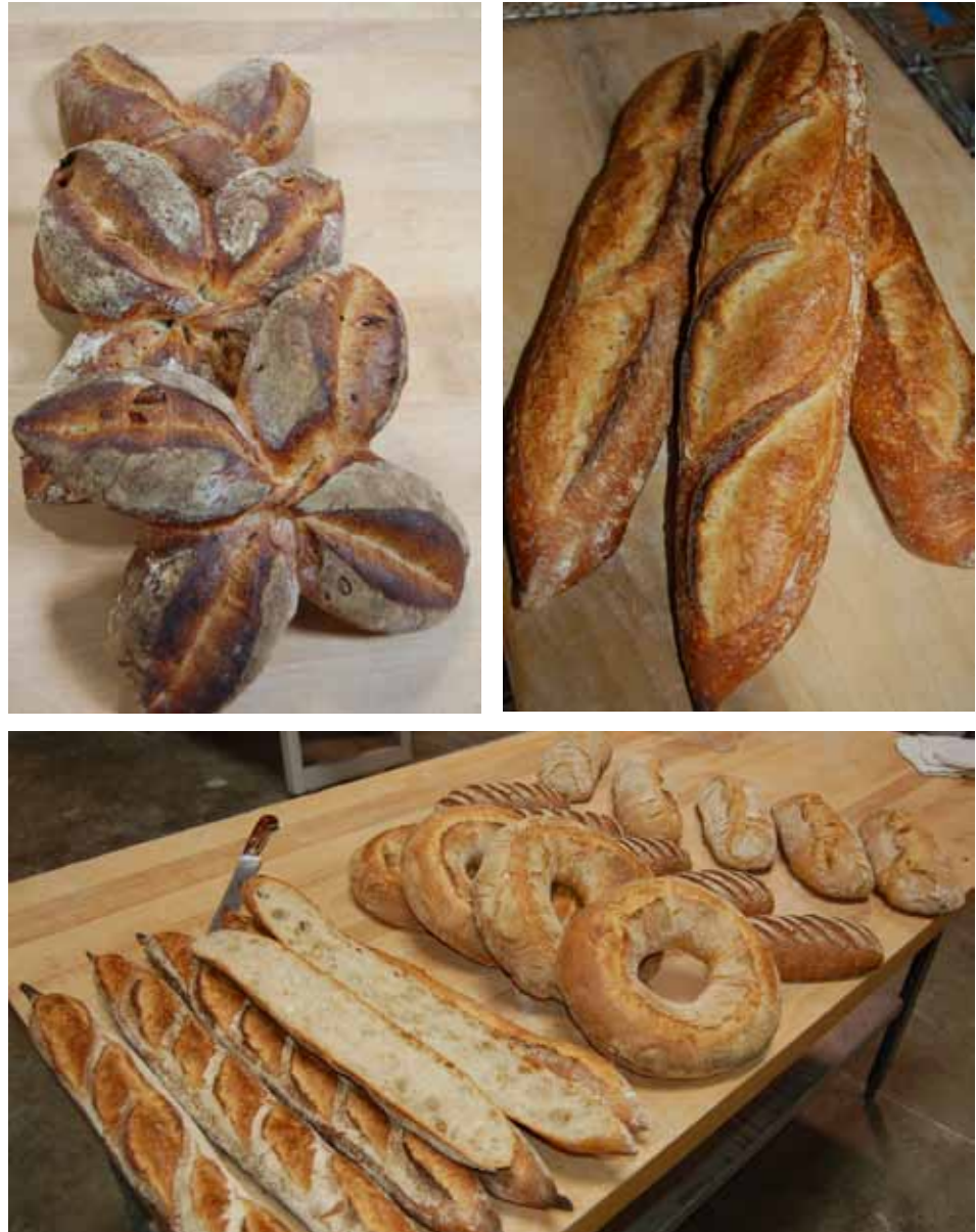
A selection of sourdough breads with different hydration percentages

Megee also gained knowledge in the function of glucides, simple sugars (monosaccharides, disaccharides) and complex sugars (polysaccharides) in flour composition. Non-starch polysaccharides, such as pentosan, have a major impact upon mixing with regard to water absorption capacity, water distribution and overall dough viscosity. The differences between soluble and insoluble pentosans are that they will react differently within the dough.