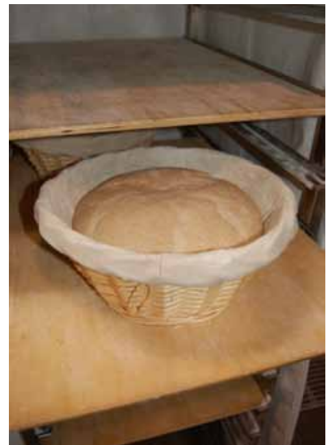
A 1.5kg miche using high-ash flour proofed for 16 hours with the addition of 230per cent liquid levain