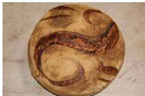
The final baked sour miche